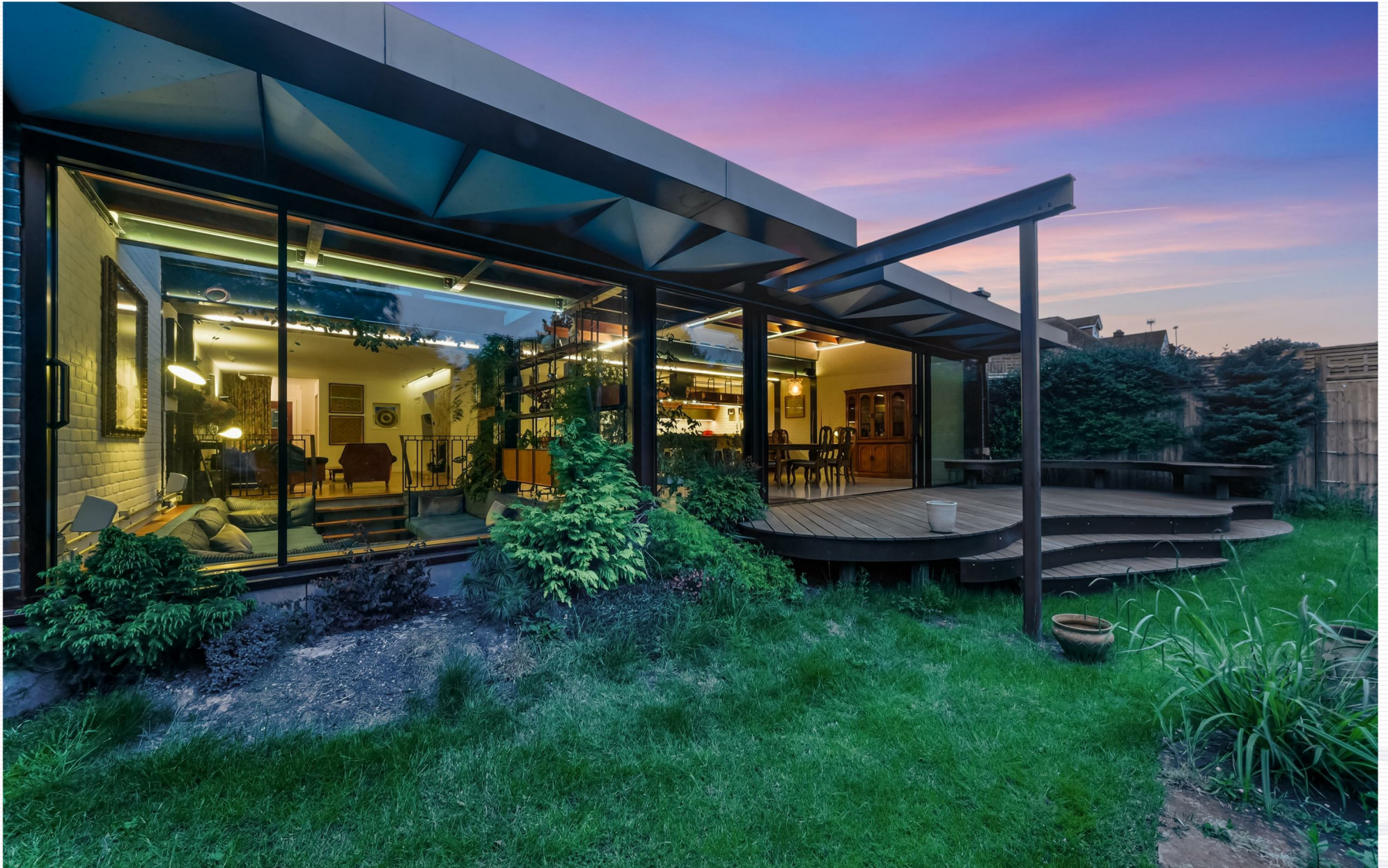
Hood Road, Wimbledon, SW20 0SR